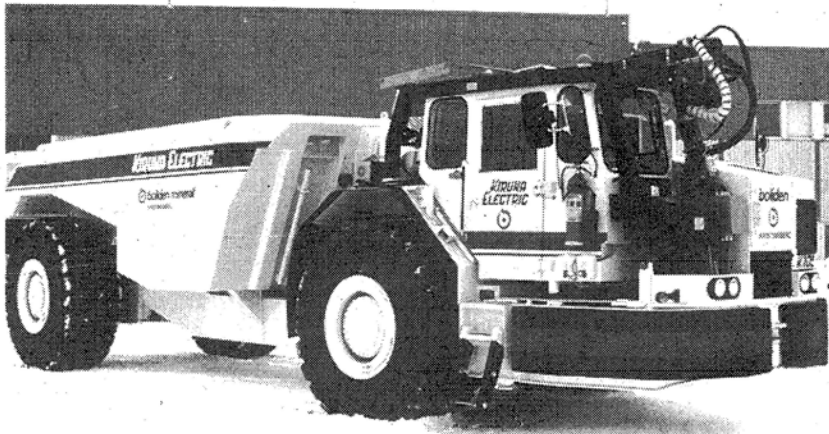
The ABB Kiruna Electric 50t mine truck now available in a 35t version.

THE first order for the 35t payload electric truck, Kiruna Electric K635E, has been placed on ABB Industrial Systems of Sweden by Union Miniere Sweden AB.